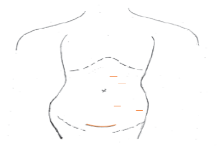
Left Laparoscopic Nephrectomy

There are two types of operations to remove a kidney: