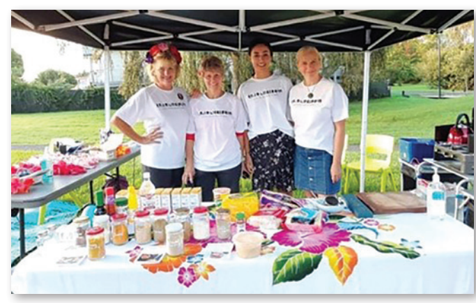
ADHB renal team at the Wesley Market

Other members of the renal ADHB team have been busy with screening the public in the main foyer in Auckland city hospital on the 6th of April. They screened 120 people and 17 were seen by the nephrologist that day.