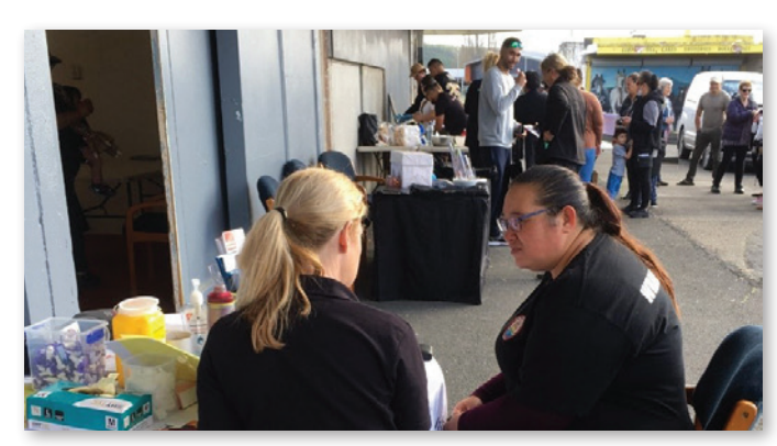
Testing at the Maori Health Expo in Murupara

Kidney Health Newsletter - If you'd like to hear more about the kidney community or you know someone who would benefit from getting our newsletter, you can see past newsletters and sign up here: https://www.kidney.health.nz/Newsletter/