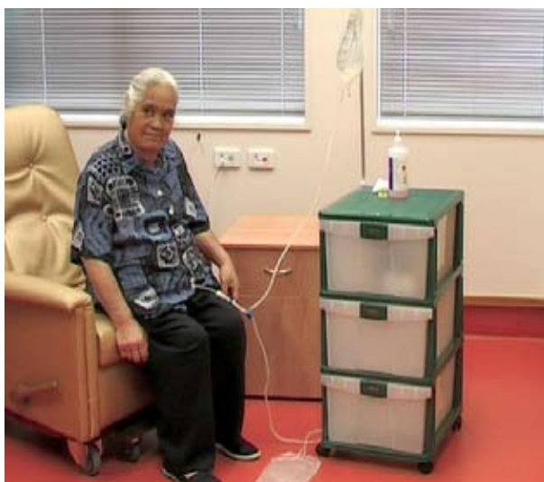
Patient on peritoneal dialysis

There is a machine that can be used for peritoneal dialysis. The kidney team will discuss with each person if they need to use this instead.