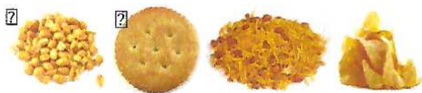
Snacks - crackers, salty nuts, crisps, bhujia mix