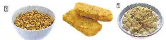
Honey puffs, puffed wheat, porridge (rolled oats) without salt added, wheat biscuits (limit to 2 biscuits a day)