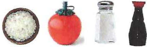
Salt – all types (including 'Lo Salt') Soy, oyster and fish sauce Worcester, sweet chilli sauce, tomato sauce

Swap these higher sodium foods ..... for ..... these lower sodium foods