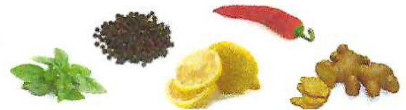
Herbs and spices (fresh or dried) Lemon or lime juice, black pepper, vinegar Fresh ginger, garlic or chilli