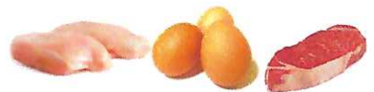
Fresh meat, chicken, fish or eggs Low sodium tinned fish